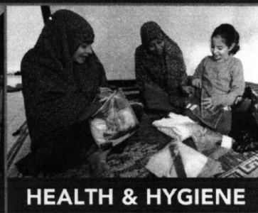
HEALTH & HYGIENE