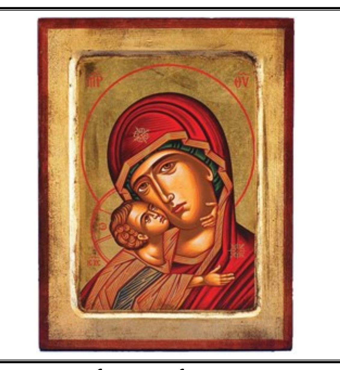
Sunday, December 14, 2014 Twenty Nineth Sunday after Pentecost and Sunday of the Forefathers